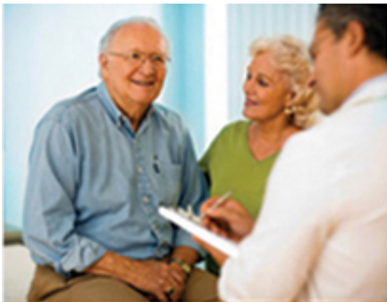
Our Day Hospitals

Presmed Australia is one of the leading healthcare companies in Australia that specializes in establishment and management of ophthalmology day hospitals.